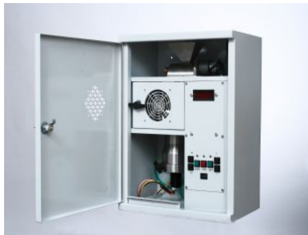
The halogenerators which are installed on the outside wall of the salt room: Iris 36 and Iris 35M